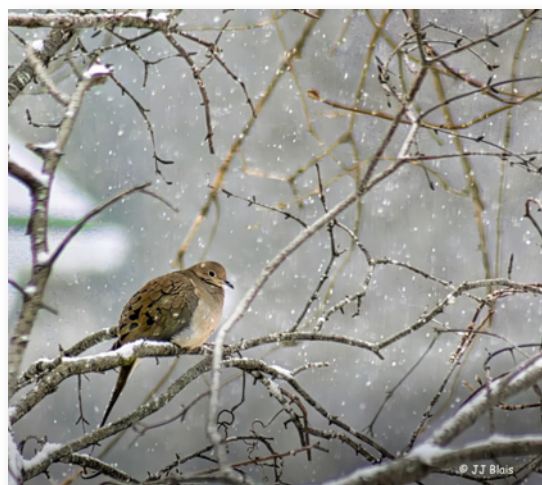
Here is the complete image of the photo used in the masthead.

We hope you enjoy the inaugural edition of your Connections newsletter for 2024. As we forge ahead, the Board is actively looking for volunteers to come forward and play an integral role in shaping and bringing life to new events or activities